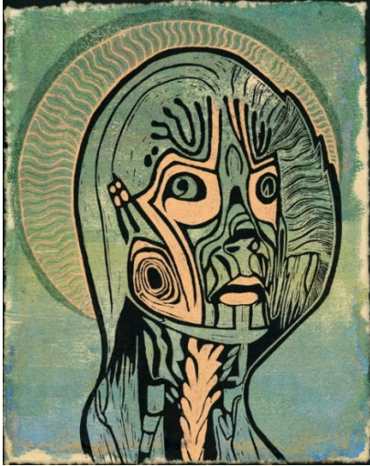
Nancy Good - Mystic

Creativity offers us a new formula for life